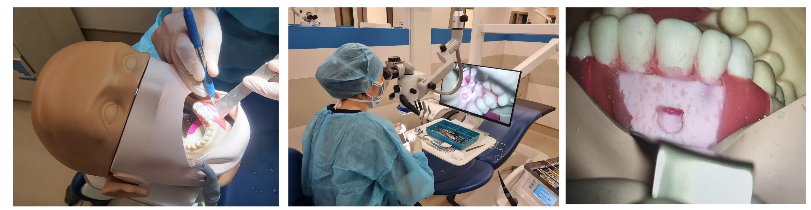
Figure 3: 3D jaw model mounted on phantom head

The post-EMS questionnaire found that the residents felt more prepared to perform EMS after going through the 3D surgical simulation (mean 4.8), and that the simulation training led to reduced stress levels when performing their first EMS (mean 4.5).