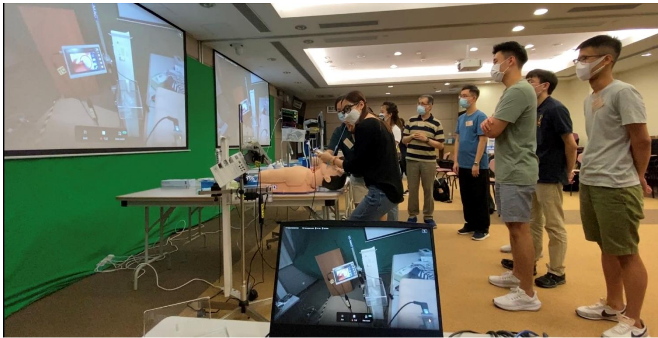
Fig 2: Expert trainer wearing eye tracking device and performing intubation in one go. The trainee can visualize the visual pattern and visual strategies of the expert. The coordination of the procedure including the visual pattern was visualized and broadcasted on a real-time basis to the trainee for better understanding.

Eye-tracking technology showed the potential to facilitate novices in understanding the visual strategies of a procedure and enhance procedural skills transfer.