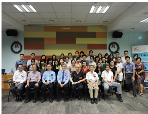
FY2016 AM-Ethos winners and the ACP administrators at the Networking session on 13 December 2016