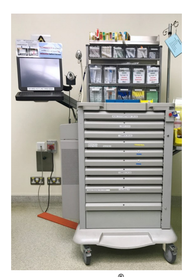
Omnicell® Work Station

The clinical arm of the ACP continues to define and refine its goals to achieve safe patient care in the perioperative environment. Medication safety is integral to safe anaesthesia care and despite the good intentions and efforts of institutions and individuals alike, this continues to be a challenge. As always, baby-steps in the right direction will get us there.