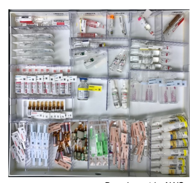
Drug layout in AWS

The WHO and JCI identify confusing drug names as one of the commonest causes of medication error, in part due to 'Look Alike Sound Alike (LASA)' drugs. At KKH, for all anaesthesia-related drugs, an additional colour-coded label is applied in order to make a drug ampoule or vial easier to identify. These labels provide an extra measure in the reduction of medication errors by ensuring against the use of medicines that fall into the wrong storage bays or are incorrectly picked when an individual is rushed.