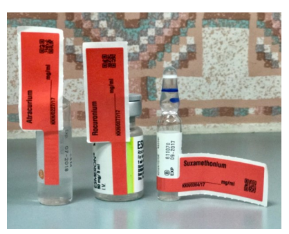
Colour coded labels for drug identification

drug-allergies when it is logged into for access to the medicines. Despite the initial resistance, it has changed the way we work and made the work practices safer, by providing a standardised drug cabinet with controlled access.