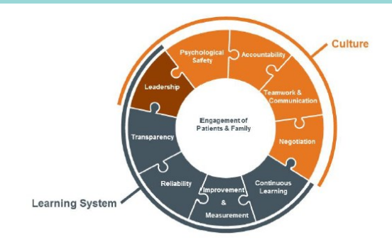
IHI Framework on Safe, Reliable & Effective Care

<u>Click here</u> to find out more about the framework.