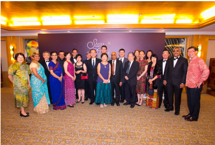
Alumni gathering at the Gala Dinner