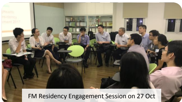
FM Residency Engagement Session on 27 Oct

"Coming together is a beginning; keeping together is progress; working together is success."