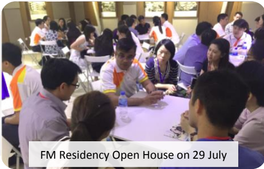
FM Residency Open House on 29 July