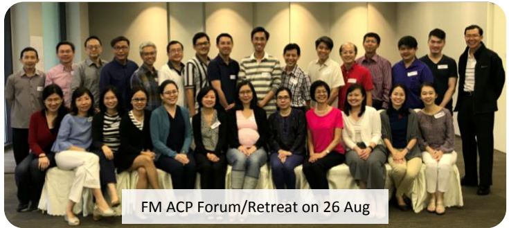
FM ACP Forum/Retreat on 26 Aug