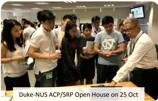
Duke-NUS ACP/SRP Open House on 25 Oct