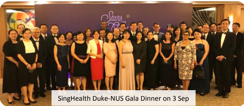
SingHealth Duke-NUS Gala Dinner on 3 Sep