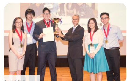
6 th APPCRC in conjunction with FM Symposium from 21-23 Sep