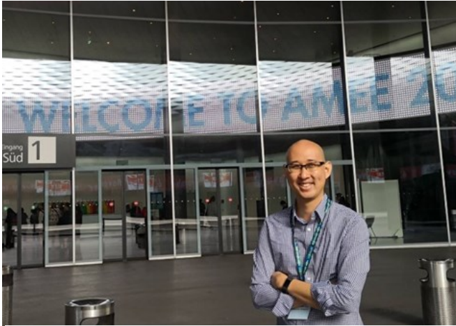
At AMEE 2018 in Basel, Switzerland

Mention the words educational qualitative research to a friend and one is likely to be met with a quizzical stare. For most of us, quantitative research with its clinical trials and numerical measurement of the impact of interventions remains the most familiar form of research. However, not everything that can be counted is important, and many important answers to questions (such as motivations, the reasoning process and emotions) are not quantifiable. Where qualitative research comes into its own is in answering the 'why' and 'how' questions to everyday issues faced in education and patient care. The senior residency elective in obstetric anaesthesia with research opportunities provided a stepping stone to embark on educational research and the world of qualitative research.