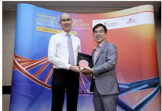
Receiving the Best Oral Paper (Education Research) award at SingHealth Duke-NUS Scientific Congress 2018

our SRs faced doubts, which highlighted how hierarchy can sometimes shape learning interactions and represented a missed learning touch point for SRs on call.