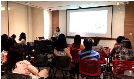
AC Readiness 10 Nov 18

for new Associate Consultants (AC) / Consultants (C) – 1st module launched on 23 Aug 18