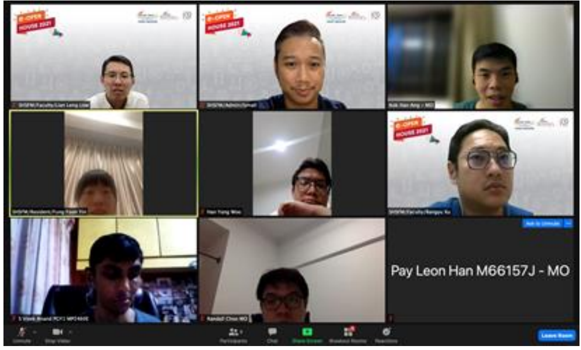
Q & A part was held in multiple breakout rooms for a more engaging session between the 160 attendees and program representatives.

An opportunity for the Program to share information on the Residency program, residents' experiences, Chief Residency, institutions in FMACP and FM research opportunities.