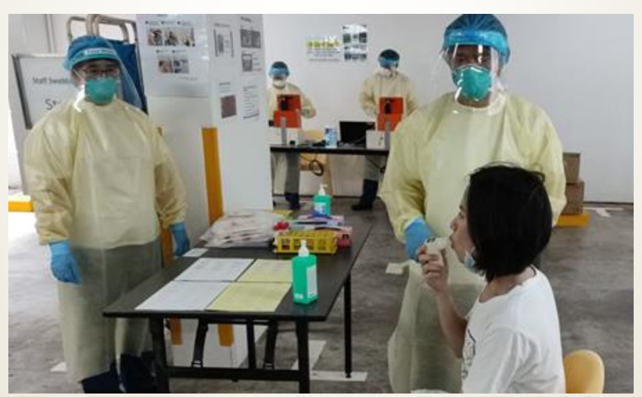
Piloting TracieX Breathalyzer in Bright Vision Hospital