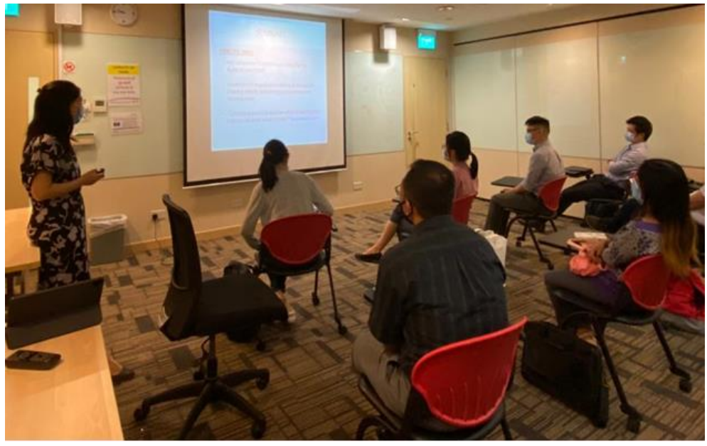
Participants had hands-on training where each prepared a lecture presentation and the trainers shared their comments on how to improve on them.