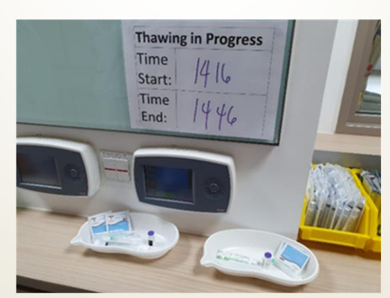
ROLL UP YOUR SLEEVES! pg. 5