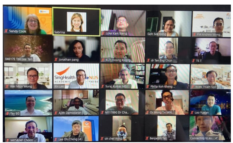
More than 90% of the invited GPs attended the event. The breakout room session was useful asthey get to share teaching tips and challenges encountered in their years of teaching

Organised by Duke-NUS Family Medicine Clerkship, and targeted at Private General Practitioners (GPs) who are teaching faculty for Duke-NUS medical students. This event provided an update on Duke-NUS MD Program and a teaching on Workplace-Based Assessment.