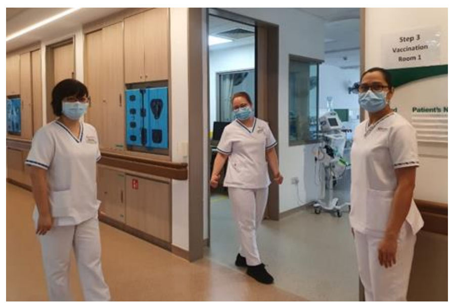
The nurses of the Infection Prevention and Control (IPC) team were onsite bright and early preparing the vaccination rooms and vaccine doses for our inaugural 'guests'.

SingHealth Community Hospitals (SCH) kicked off its COVID-19 vaccination exercise for staff on 8 January 2021 at Outram Community Hospital and Sengkang Community Hospital.