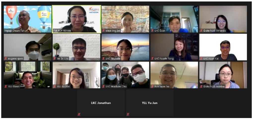
12 medical students attended the session on 21 January

An initiative to engage local medical students on available research opportunities in FM ACP institutions and departments