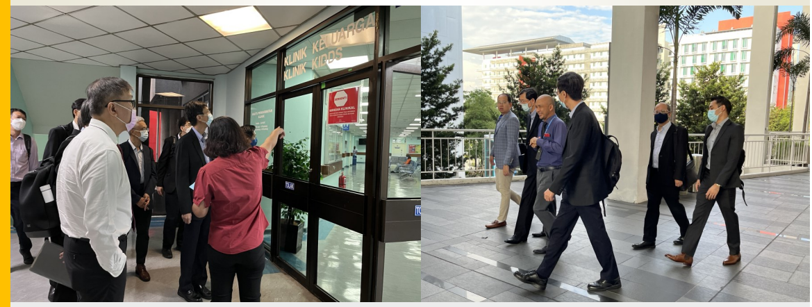
FM ACP Study Trip to Institutions in Kuala Lumpur, Malaysia