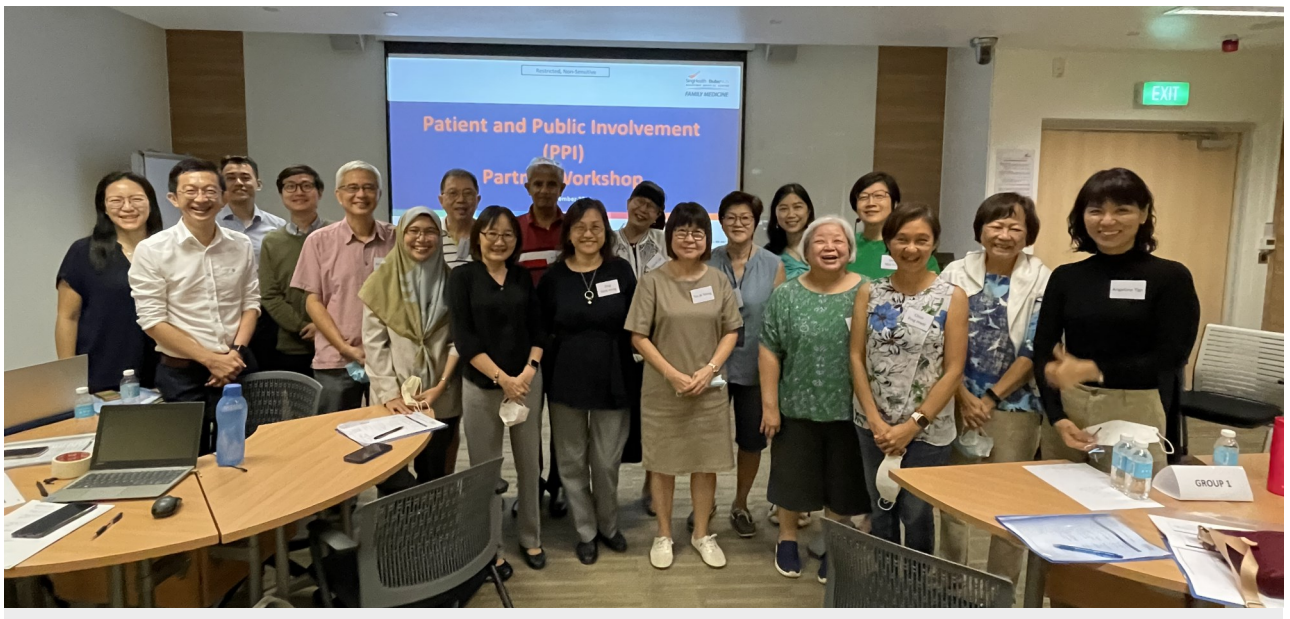
Participants at the PPI workshop for PPI partners