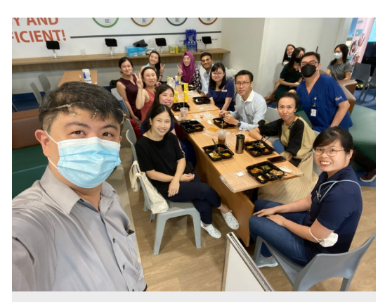
The 42 attendees were treated to lunch upon registration before sitting in for a series of informative talks about Residency given by our ACP leaders, Faculty members and Residents.

The Family Medicine Residency Program organised its annual engagement event for House and Medical Officers at SHP-Eunos. The event closed with a breakout session where Faculty members and Residents engaged the attendees in breakout groups to address their queries and share about their Residency experiences.